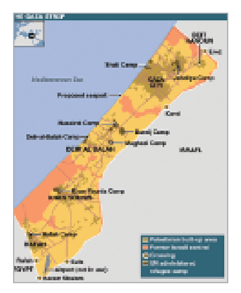
Figure 1: The Gaza Strip

Each month a MiST surgeon with an orthopaedic sub-specialty interest will spend 10 days at the European Gaza Hospital. Prior to his visit, patients would have been